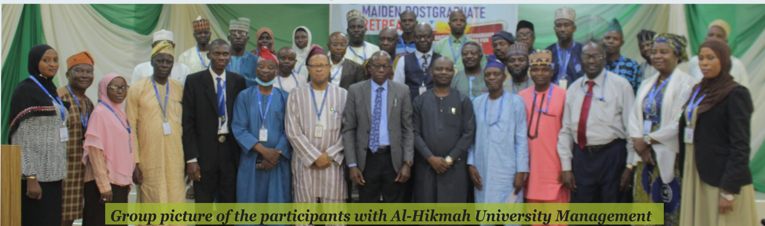
Group picture of the participants with Al-Hikmah University Management

According to him, “the way forward for postgraduate programme is recruitment of graduate students, improvement of curriculum, clarity of courses and administrative procedures, adequate facilities and resources, encouraging research for development, learner-centered programmes, collegiality, valuing students as adults with experience and expertise, trained and resourceful staff, mutual relationship between University and the society, lifelong learning, ICT, development and utilization, keeping up-to-date webpage, showcasing of areas of excellence and success, individual mentoring by lecturers to attract students and increasing focus on student satisfaction”.