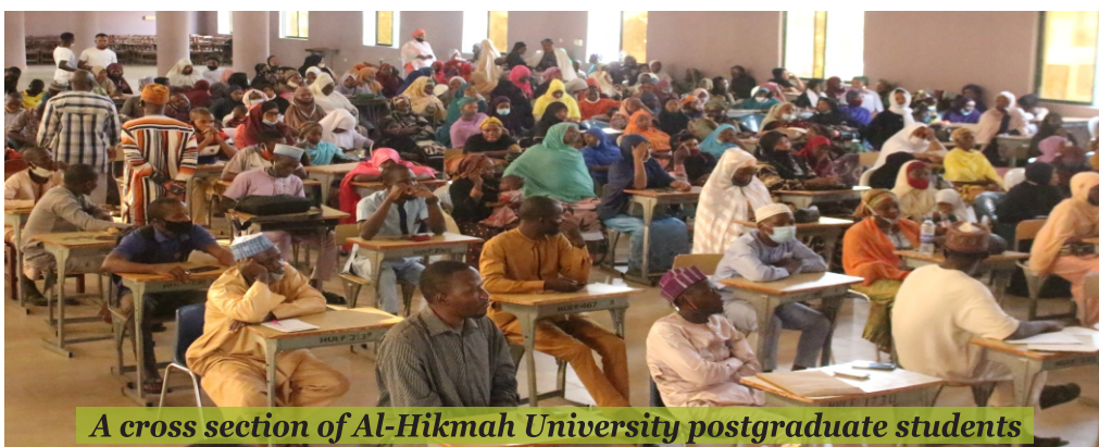
A cross section of Al-Hikmah University postgraduate students

He therefore urged the students to pay their tuition fees on time and stop delaying their payments because delaying payment attracts consequences of extra payments and may eventually lead to stoppage of the students programme.