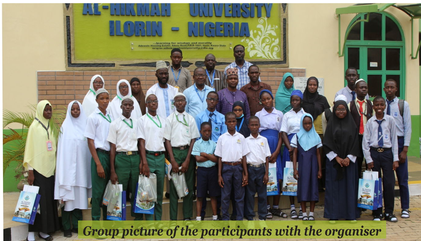
Group picture of the participants with the organiser

The competition which was in three stages had participants from eight different secondary schools in Kwara State. Six out of these schools progressed to the second stage which took place on Thursday, 12th May, 2022; four schools got to the final stage while three schools emerged as the winners. Islamic College, Ilorin took first position, Ijara-Isin High School took second position and Iqra College, Ilorin came third. Gifts were presented to all the winners and the schools that participated in the programme.