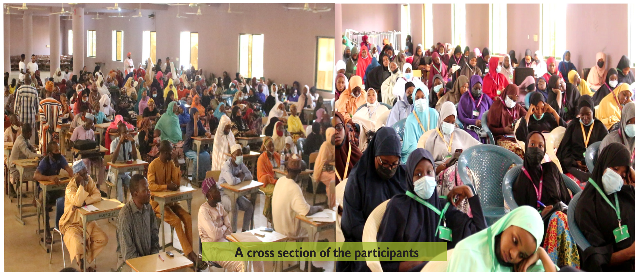
A cross section of the participants