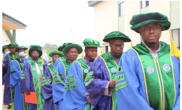
The Vice-Chancellor Procession