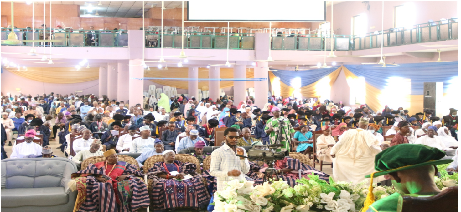
A cross section of the audience