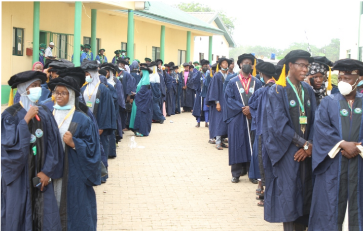
Procession of University Scholar Across Department