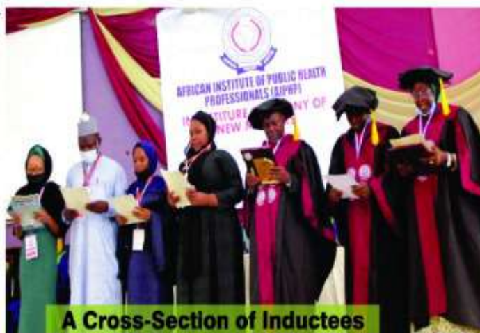
A Cross-Section of Inductees

programmes, designing health service delivery system, making policies and regulatory initiatives, conducting community wellness programmes, identifying potential threats in a community, conducting researches to seek to solution to identified illness and providing counseling to the needy”. He added that health promotion, surveillance, research, risk communication, disease prevention, epidemics outbreak analysis and monitoring are all components of public health.