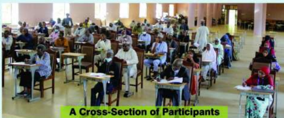
A Cross-Section of Participants

added that the component of course content is crucial to the learning of the student and that is why lecturers should not take it with levity as it would be a key determinant of the students' level of success. He therefore, urged the university lecturers to put in their best in order to meet up with these global best practices.