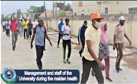
Management and staff of the University during the maiden health