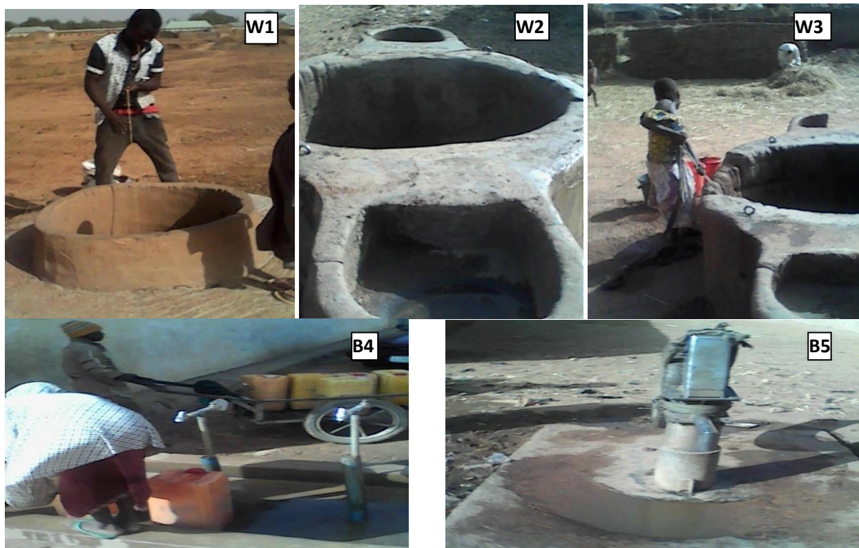
Figure 2: The five water sources in Diggi village